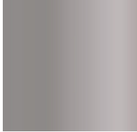
Matte White Lacquer - MWL